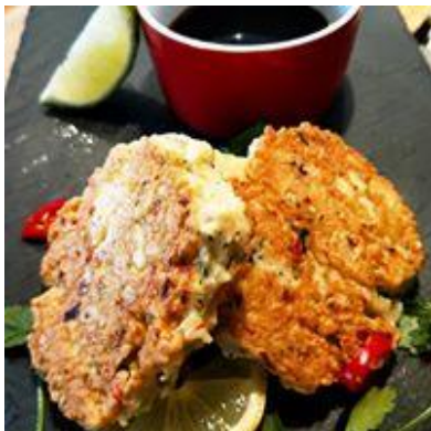
Thai Fish Cakes with Sweet and Sour dipping sauce (2 per serve)