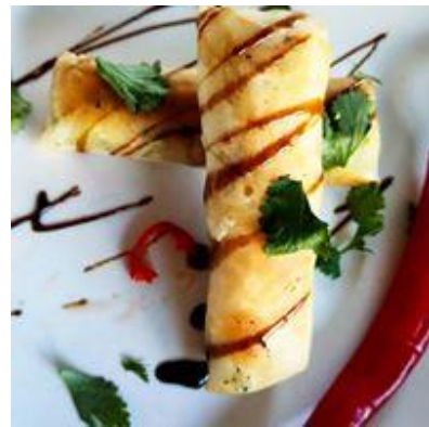
Hand Made Beef or Vegetable Spring Rolls with Kecap Manis ( 2 per serve)