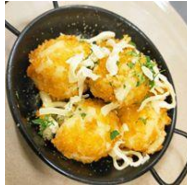
Crumbed Macaroni Cheese Puffs ( 2 per serve)