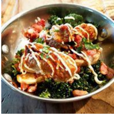
Southern Fried Chicken Pieces with Aioli and Fried Bacon Bits (4 Per Serve)